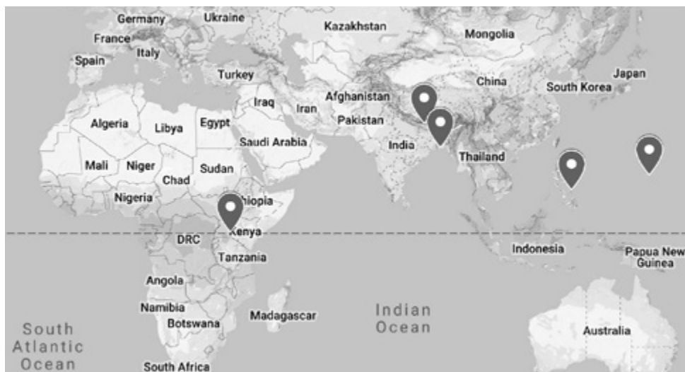
Figure 1. Map showing the location of the five case study sites

Source: map data © Google 2019; markers showing the five case study sites added by the authors.