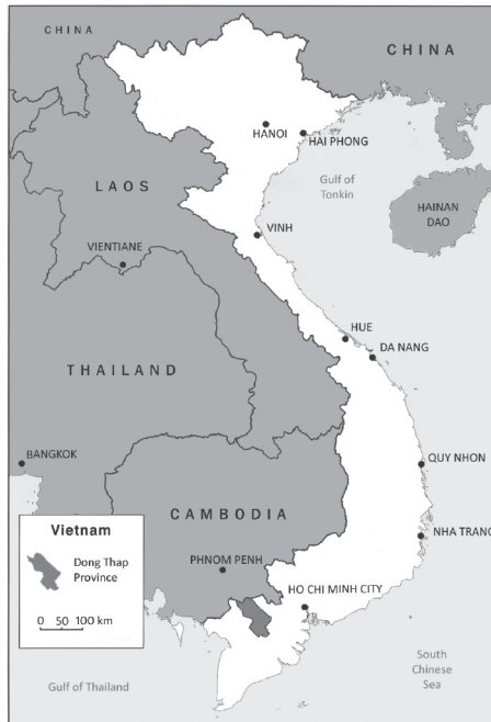
Figure 1: Map of Viet Nam, indicating the research area (Dong Thap Province)

chiefs of the Women's Union and the Farmer's Union), staff of national government agencies, such as the National Institute of Meteorology, and provincial and district officers of the Department of Agricultural and Rural Development (DARD) and the Department of Natural Resources and Environment (DONRE). The qualitative data from participatory research tools and expert interviews did not play a central role in this paper, but instead were used to explain the context and decision-making processes, which were hard to capture in the questionnaire survey. Lastly, existing regional data on climate, agriculture, economy and demographics were collected, particularly at the provincial level (Dong Thap Province, see figure 1). The methods, which were designed for a larger set of case studies, are described in more detail by Rademacher-Schultz and others (2012).